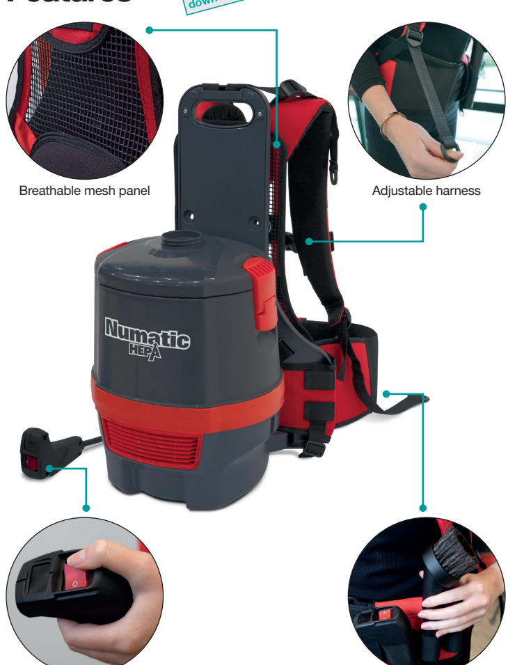
Waistbelt tool storage